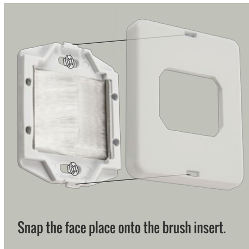
Snap the face plate onto the brush insert.